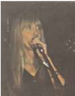
Singing Red Shoes Blues at the memorial tribute for Eddie at the Silver Dollar in October 2004